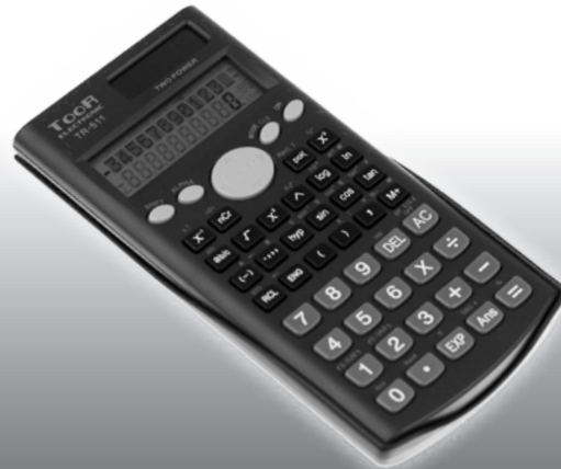
TR-511 User's Manual